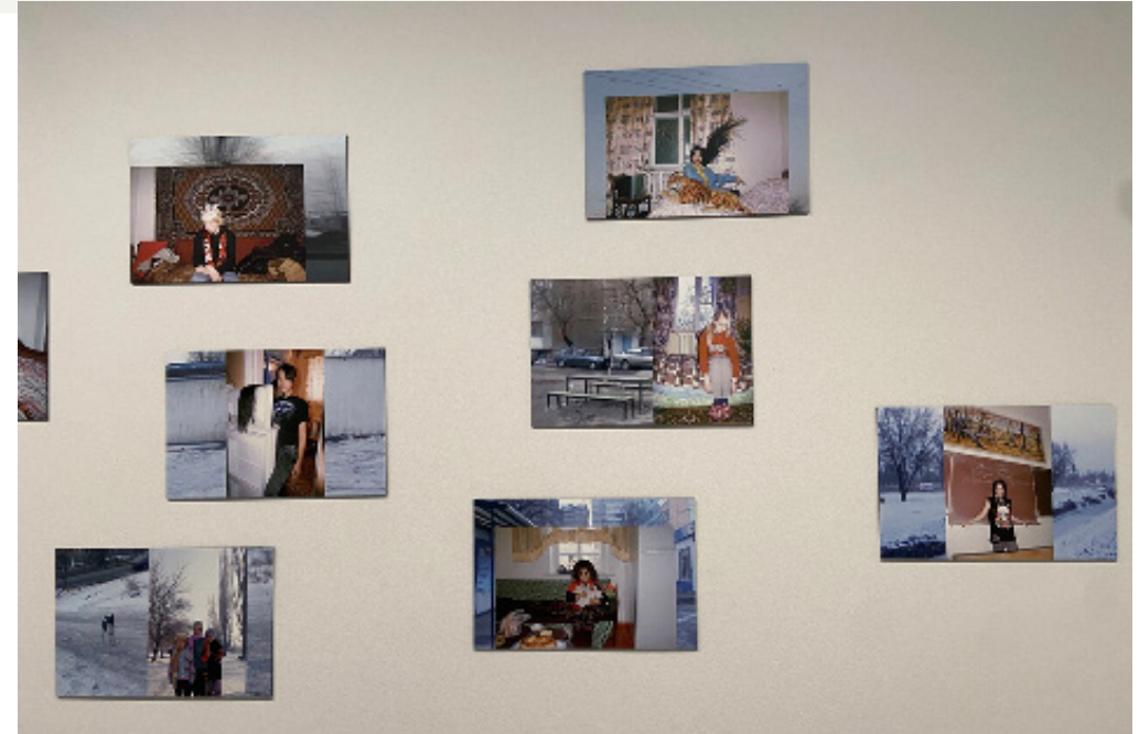
Aziza Shadenova, "Girls of Kyrgyzstan"

The series speaks of the pervasiveness of images on the internet as a means to represent the self, freeing themselves from both Western and the Soviet narratives, as well as debunking previous social norms and myths around the representation of Central Asian women.