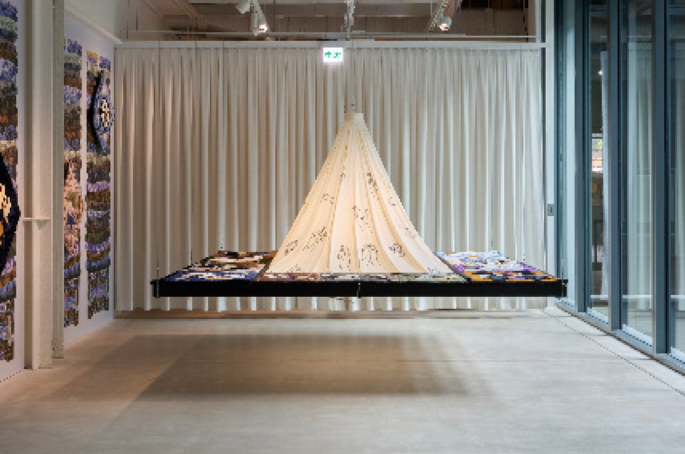
Lining Revealed - A Journey Through Folk Wisdom and Contemporary Vision at CHAT/ mill6chat, Hong Kong, 2025