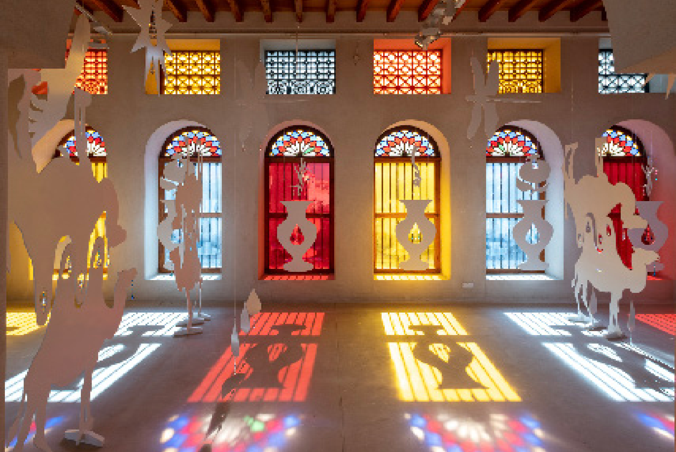
Exhibition view, Sharjah Biennial 15, Thinking Historically in the Present , Sharjah, UAE, 2023