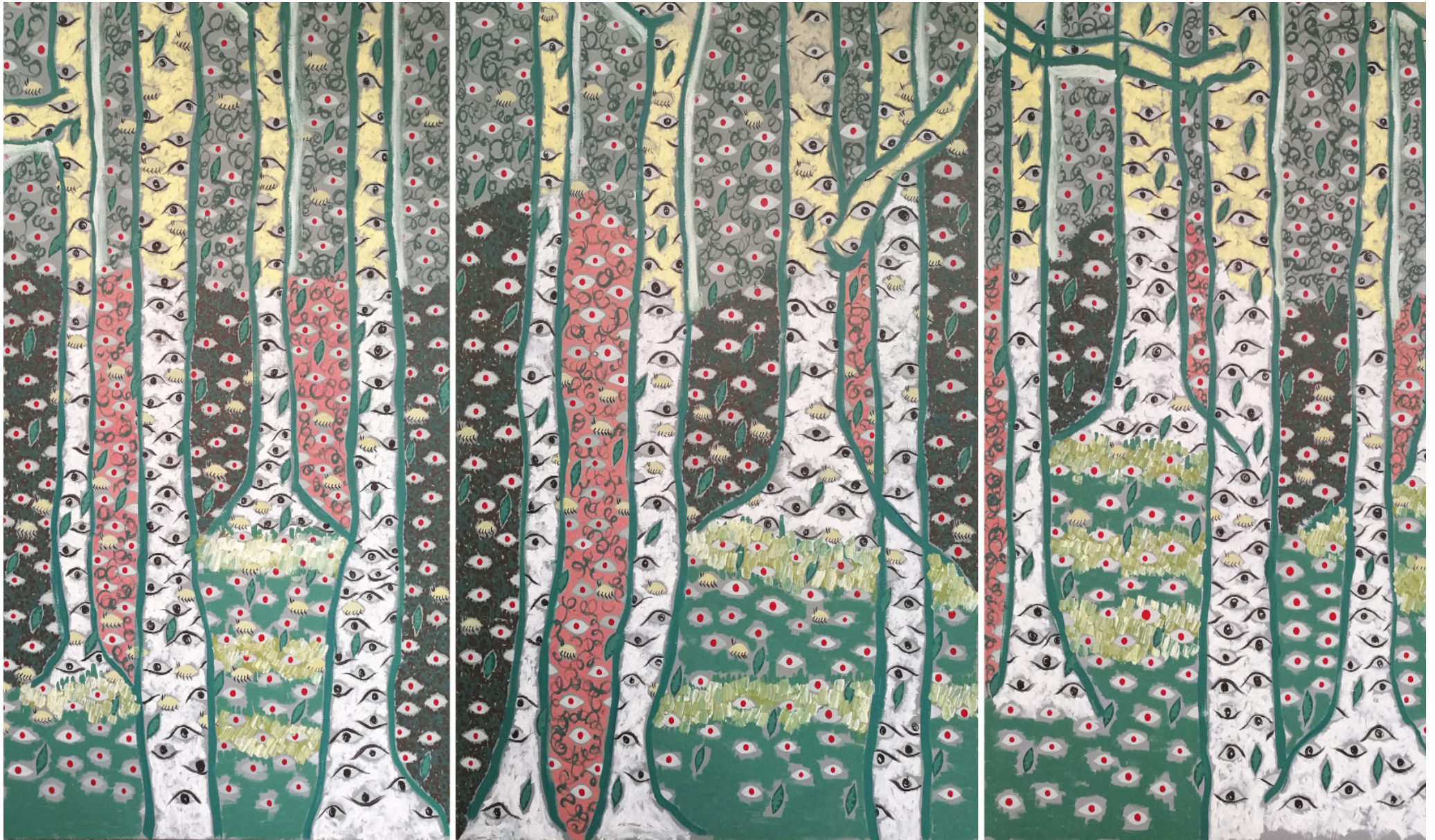
Aziza Shadenova Dawn (Triptych) , 2019 Oil on canvas 150 x 300 cm (150 x 100 cm each)