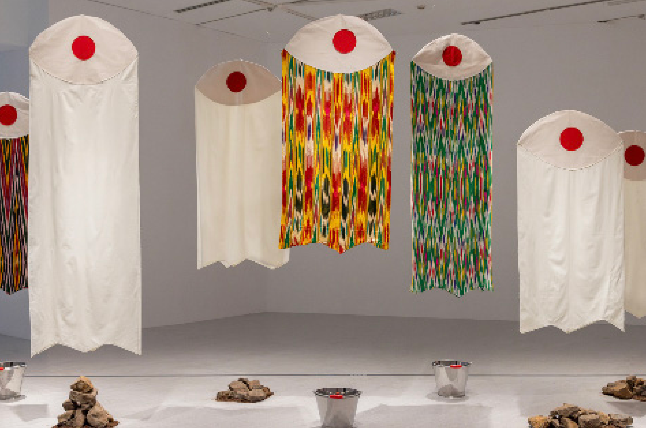
How to Hold your Breath , Asian Art Biennial, 2024