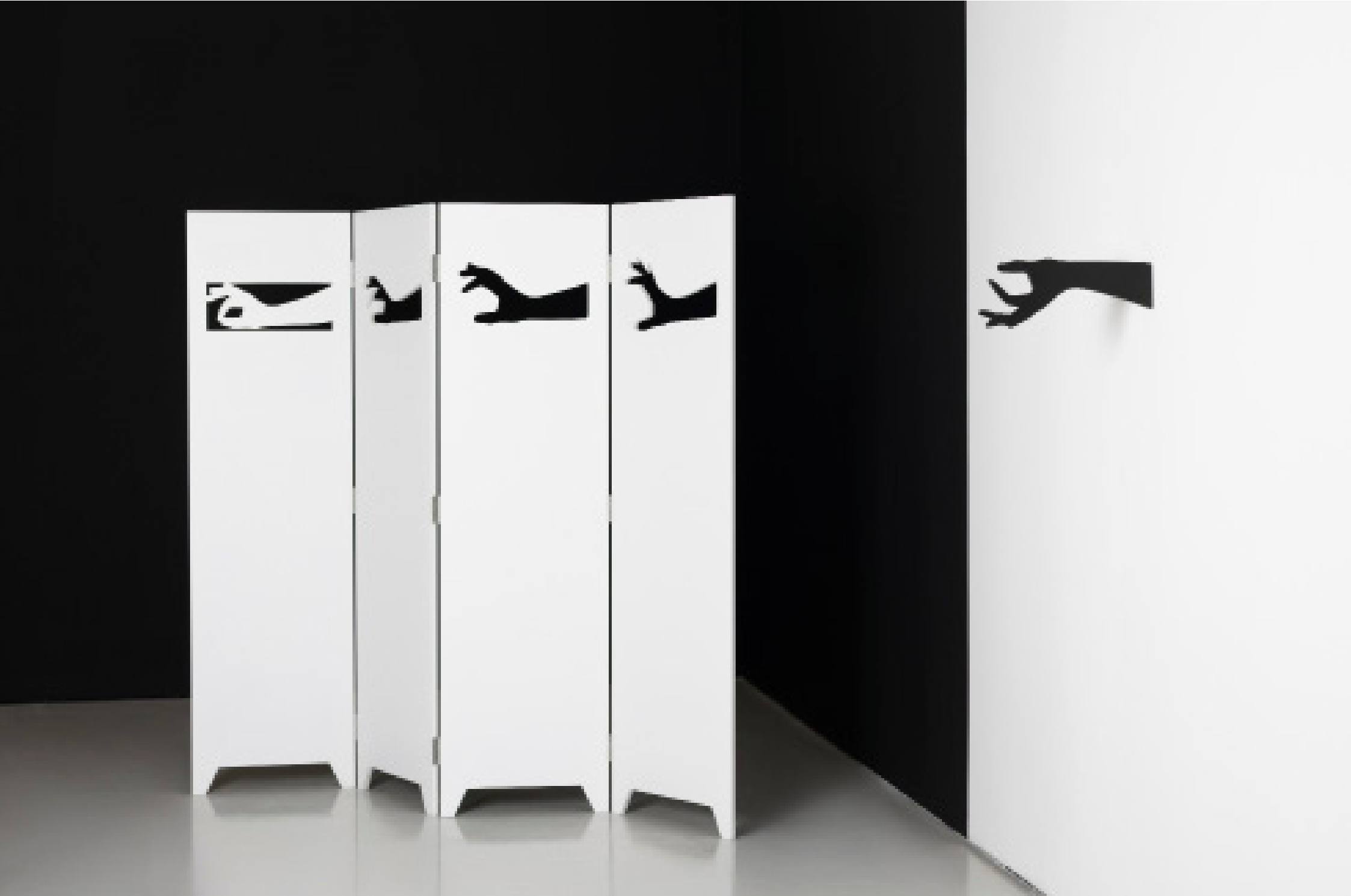
Conceal me not , 2025, Cut-out wood, mat lacquered (dressing screen & 3 wooden hands), 180 x 200 cm (screen) & 38 x 20 x 2 cm (each hand)