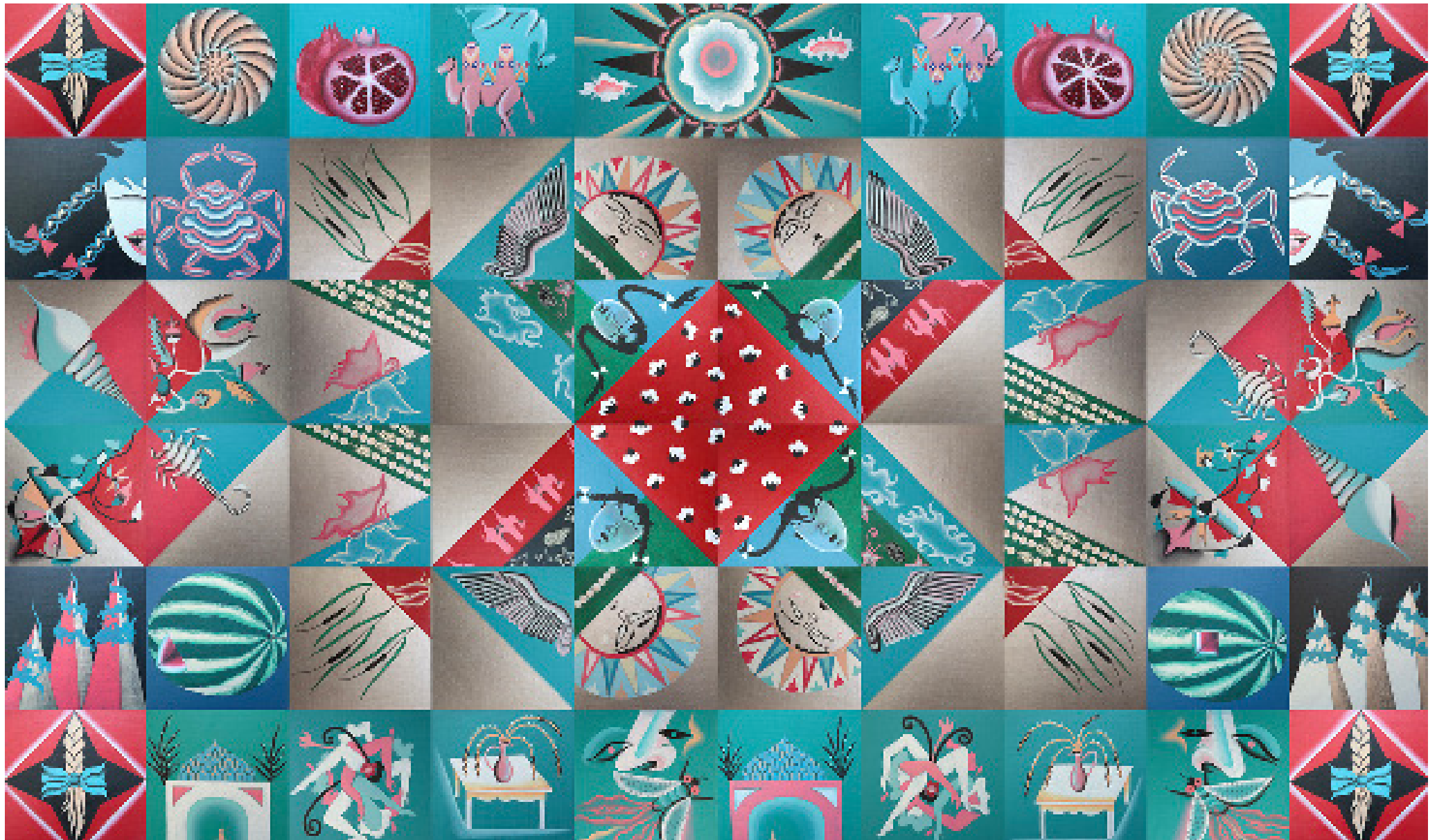
Aziza Shadenova Quilt/Korpe , 2021 Oil on canvas boards 200 cm x 120 cm, (Total: 60 Boards) 20 x 20 cm (each)