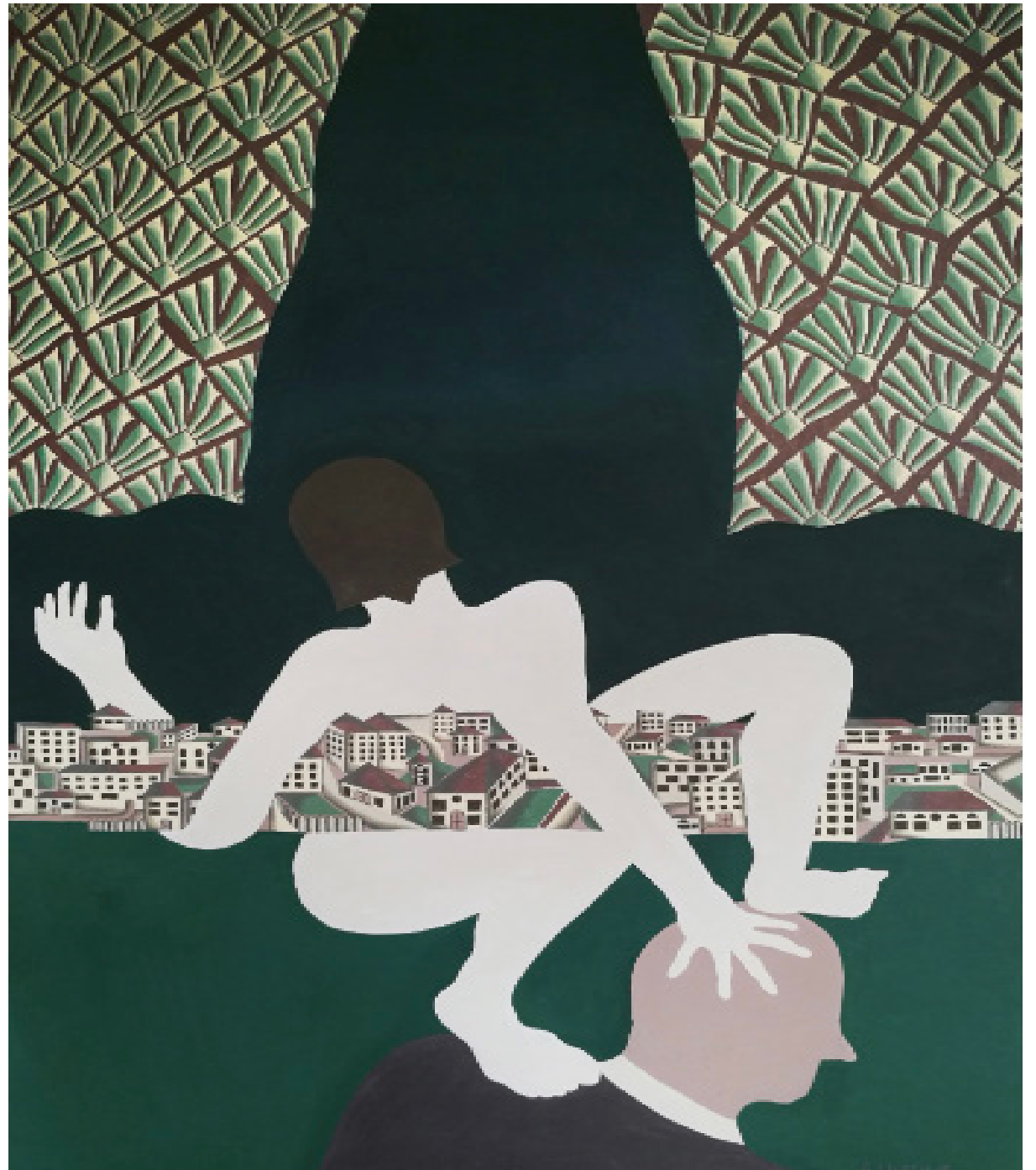
Aziza Shadenova The window , 2019 Oil on canvas 150 cm x 100 cm