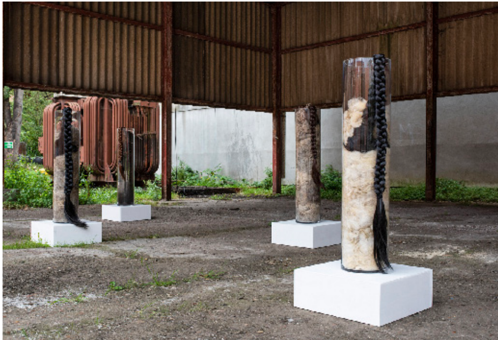
The Homemaker, Mixed media installation. (Polyester plaits, sheep fur, glass cylinders) dimensions variable.

At "Focus Kazakhstan: Post-Nomadic Mind," Wapping Hydraulic Power Station, London, 2018