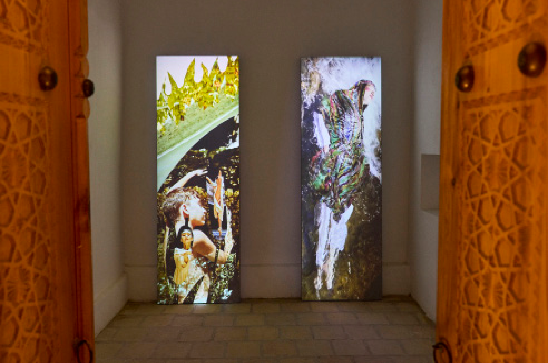
Exhibition view, Bukhara Biennial, Recipes for Broken Hearts , Bukhara, UZ, 2025