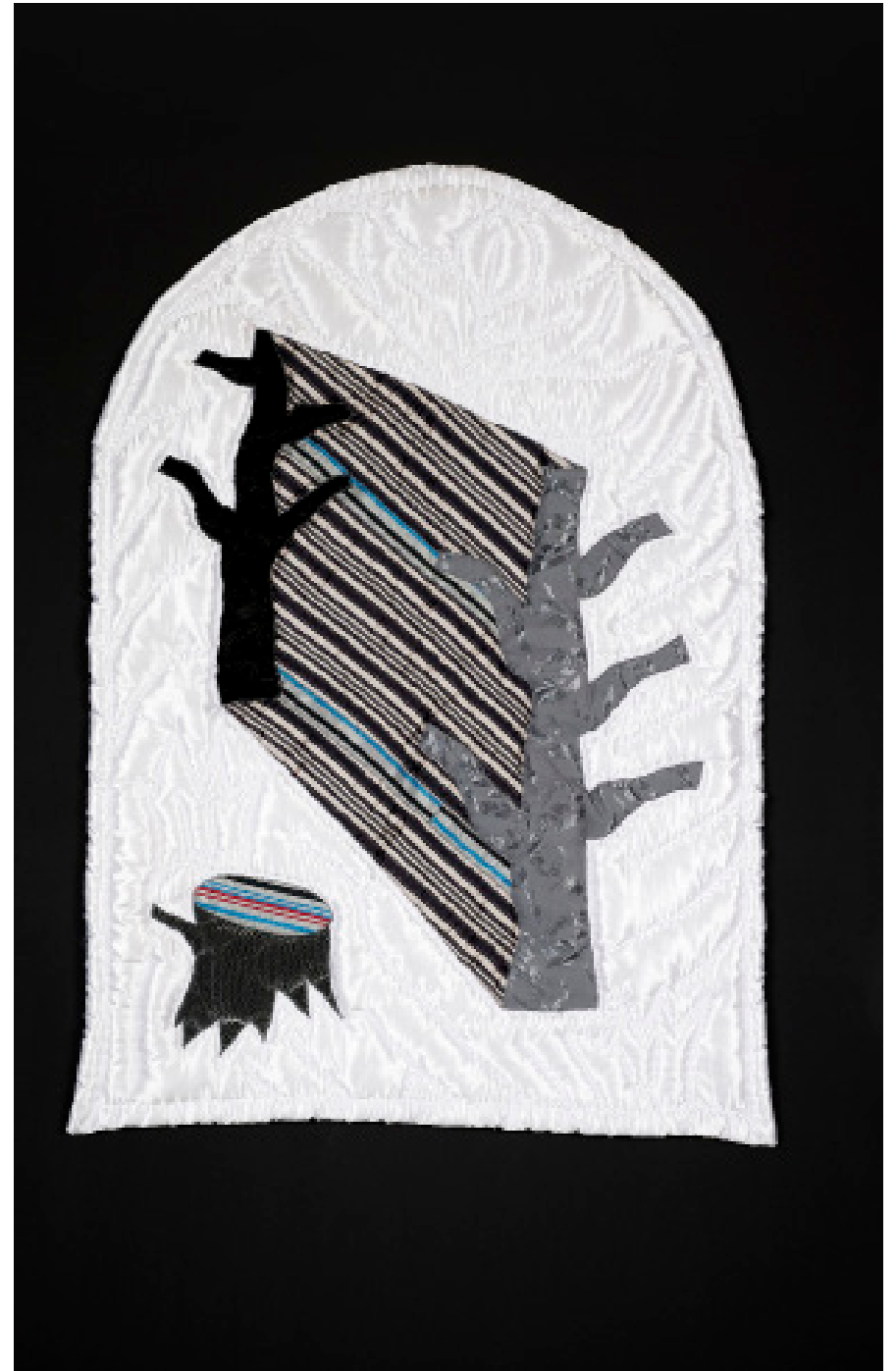
Beyond the pane § pain , 2025, Quilted vintage Uzbek fabrics, 125 x 95 cm