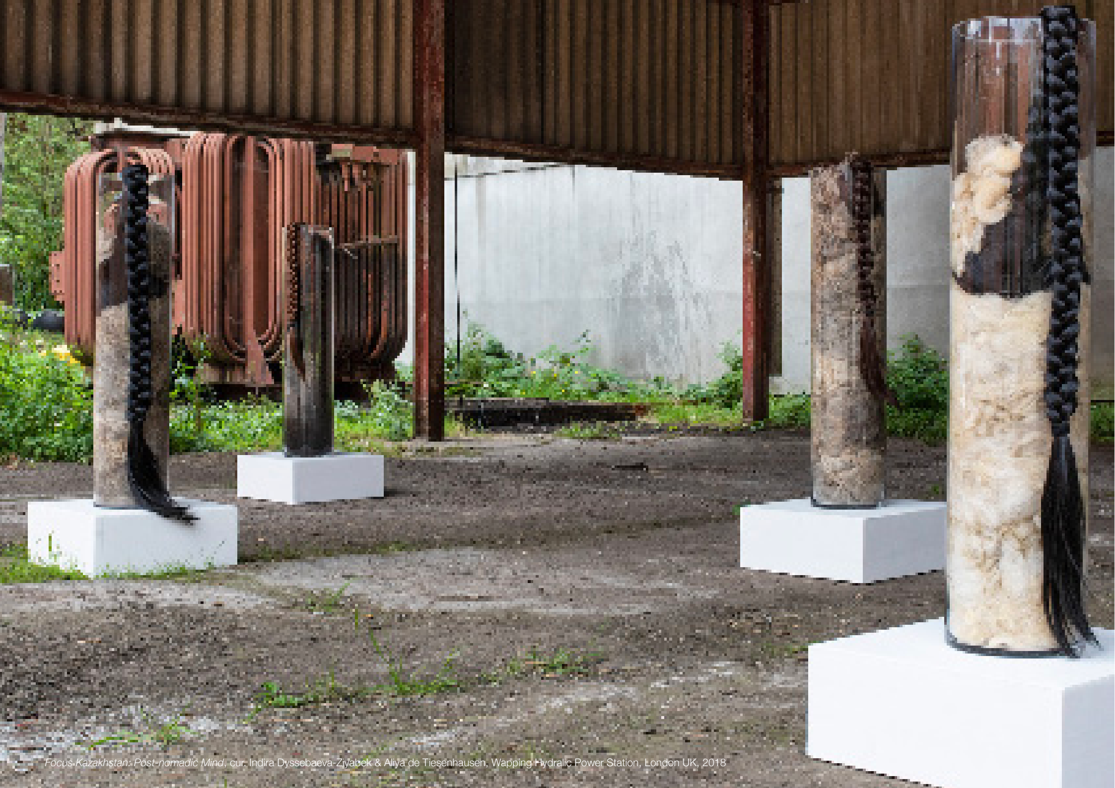
Focus-Kazakhstan: Post-nomadic Mind , cur. Indira Dyssebaeva-Ziyabek & Aliya de Tiesenhausen, Wapping Hydraulic Power Station, London UK, 2018